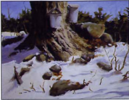
"Sap" - a 16" x 20" Oil Painting.