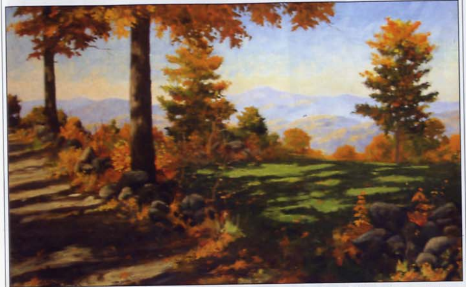
"Rowe Mountain View", a 24" x 36" oil painting on display at the Woodsum Gallery at Sunapee Harbor.